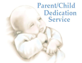
Parent/Child Dedication Service